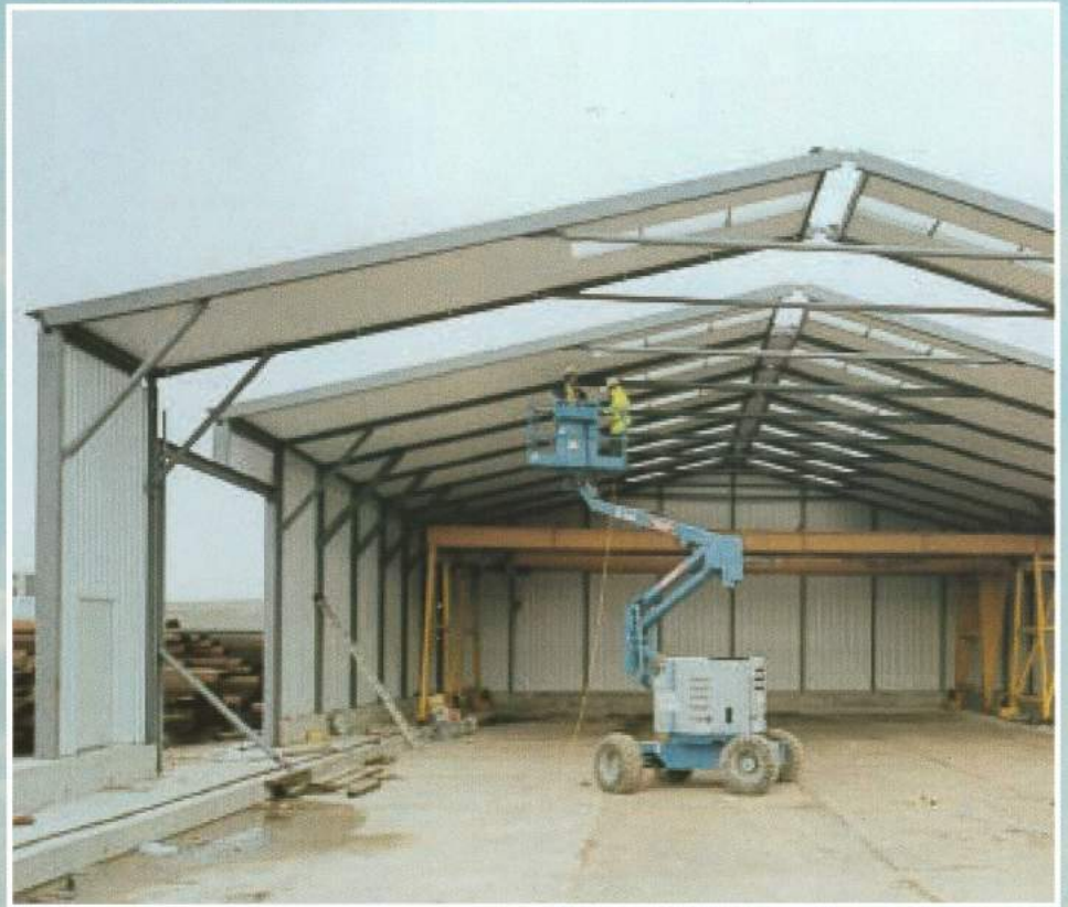
Quickway Q20 building x 38.2m erected in 12 days.

Sliding doors, translucent roof panels, plastisol coated steel cladding and steel personnel doors are fitted as standard features.